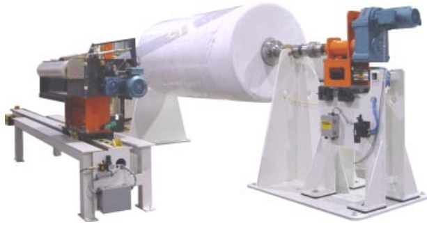
PARENT REEL APPLICATIONS