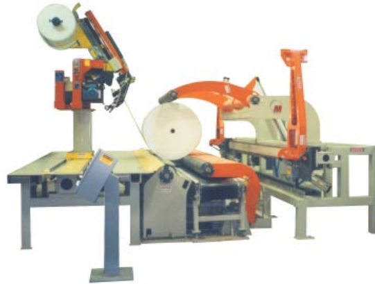
NONWOVEN AND TEXTILE APPLICATIONS