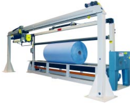
NONWOVEN AND TECHNICAL FABRICS APPLICATIONS