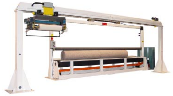
CARPET AND TEXTILE APPLICATIONS