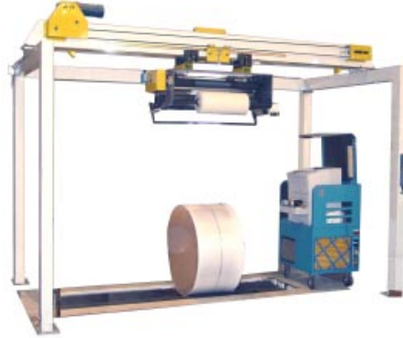
PULP & PAPER AND CONVERTER APPLICATIONS