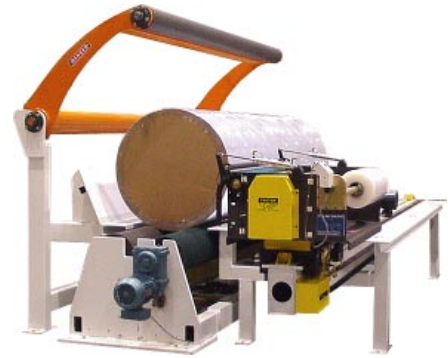
NONWOVEN & TECHNICAL FABRICS APPLICATIONS