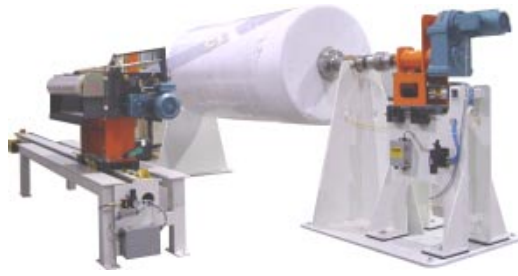
PARENT REEL APPLICATIONS