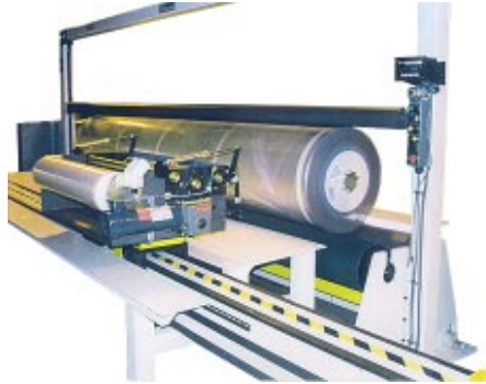
CARPET & TEXTILE APPLICATIONS